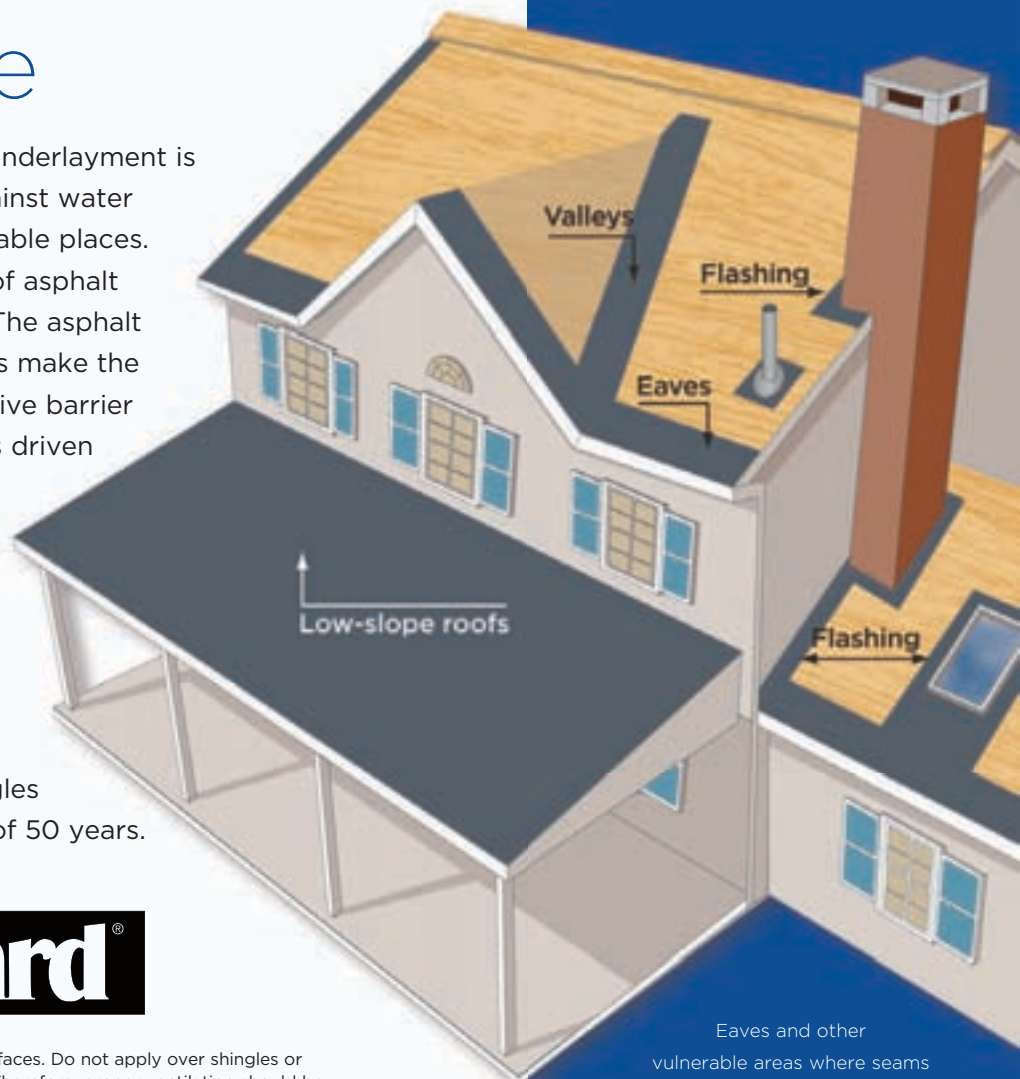
Eaves and other vulnerable areas where seams are formed and where WinterGuard beneath the shingles provides protection.

WinterGuard is warranted against manufacturing defects and to remain watertight for the same period as the warranty duration carried by the shingles applied above it — up to a maximum of 50 years.